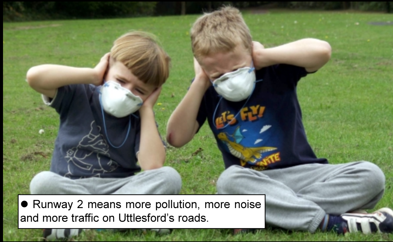
● Runway 2 means more pollution, more noise and more traffic on Uttlesford's roads.

"Our community already suffers from the effects of noise. We must ensure that noise is fully monitored and that everything is done to keep it to a minimum. That includes making sure the quietest aircraft are used, and reducing the number of night flights."