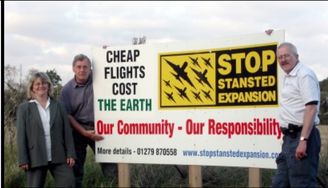
● Uttlesford's Liberal Democrat councillors are calling for an end to night flights at Stansted Airport. New evidence suggests that the effect on global warming of one night flight is the same as 12 planes flying in the day.

Uttlesford District Council's Liberal Democrat administration has made a fresh call for a total ban on night flights because of intolerable noise levels for many local residents and the growing concern of the environmental impact of night flights.