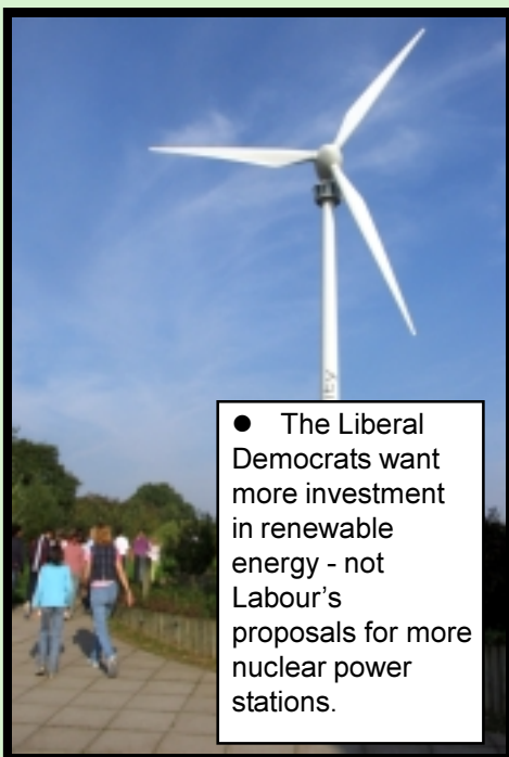
● The Liberal Democrats want more investment in renewable energy - not Labour's proposals for more nuclear power stations.

Cllr. Sell summed up "Imagine where we would be if we could spend that kind of money on clean, safe, renewable energy."