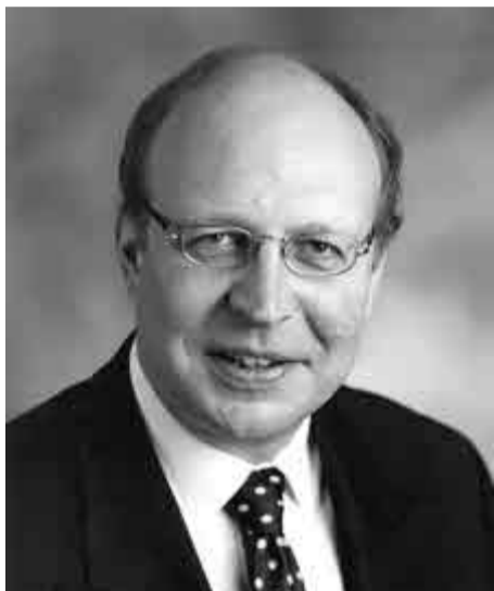
Andrew Duff MEP ☎ 01223 566700 mep@andrewduffmep.org