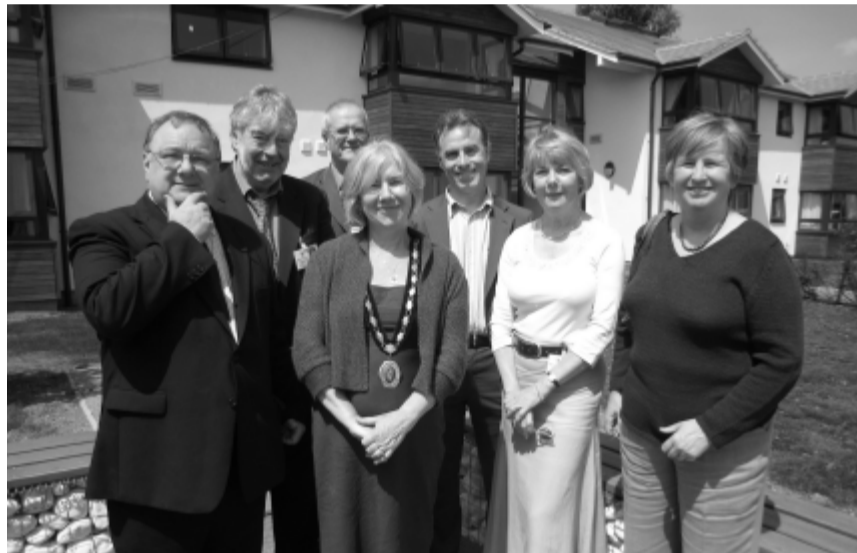
Local Lib Dems celebrate the opening of the refurbished accommodation at Vicarage Mead

"The residents really like it and I would not be a bit surprised if awards were won for this wonderful development."